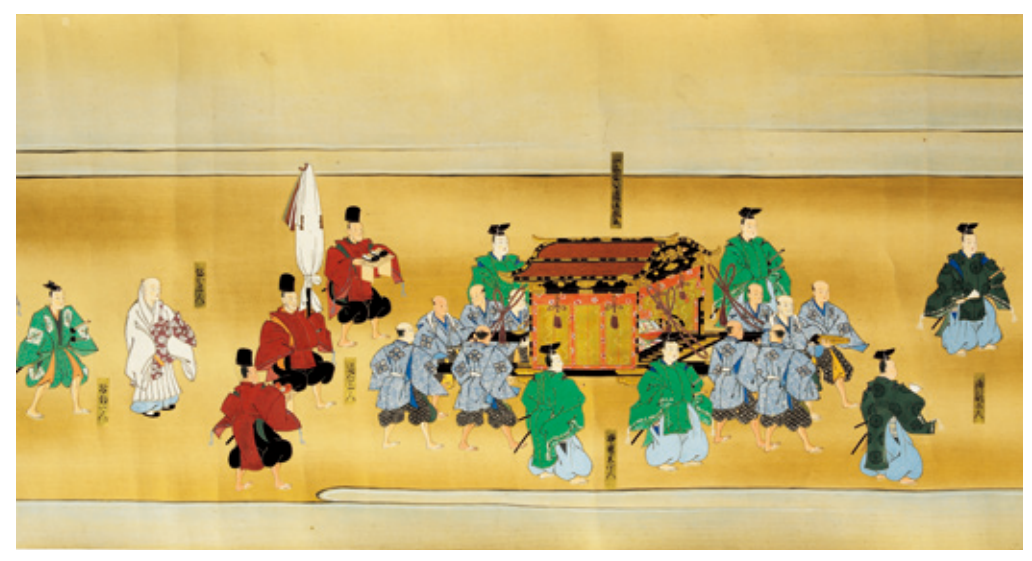
Picture Scroll Depicting a Buddhist Service Hakko (Eight Lectures on the Lotus Sutra) in the Momijiyama Tōshōgū Shrine Mid Edo period

First rotation: Tuesday, March 9 to Sunday, April 4, 2021 Second rotation: Tuesday, April 6, to Sunday, May 9, 2021 Permanent Exhibition, 5th Floor Feature Exhibition Room *Items on display may change during the exhibition.