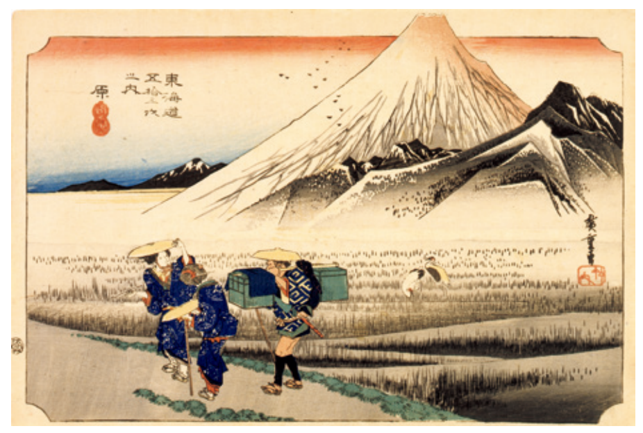
Hara: Mount Fuji in the Morning, from the series Fifty-three Stations of the Tōkaidō Road