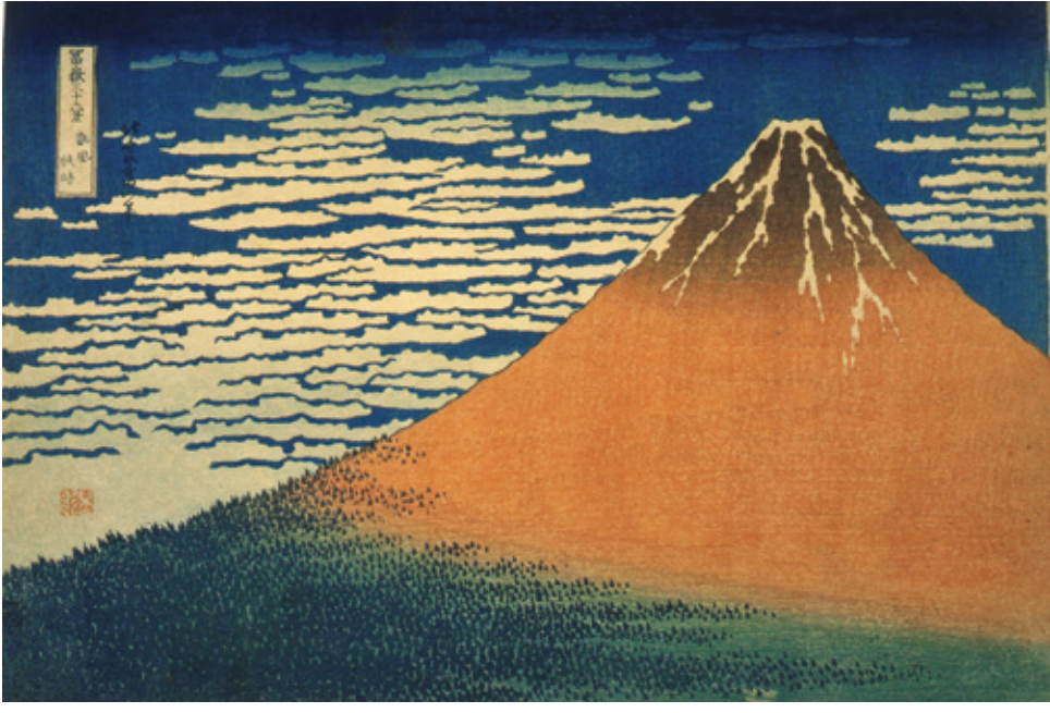
South Wind, Clear Sky, also known as Red Fuji, from the series Thirty-six Views of Mount Fuji Katsushika Hokusai, c. 1831-33

Our museum has held many exhibitions of ukiyo-e, an iconic aspect of Edo culture. This time we are taking a new approach: a special exhibition, displaying only works from the collection, entitled The Mount Fuji Challenges: Hokusai and Hiroshige .