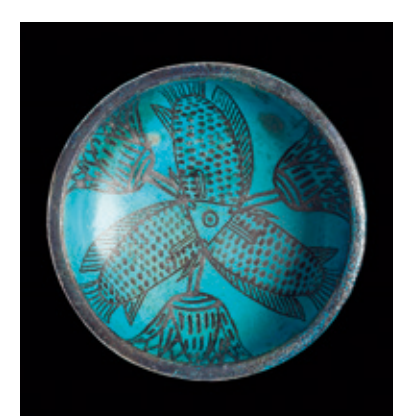
Bowl Decorated with Three Fishes Sharing a Single Head and Lotus Flowers

ca. 1450 - 1400 B.C.