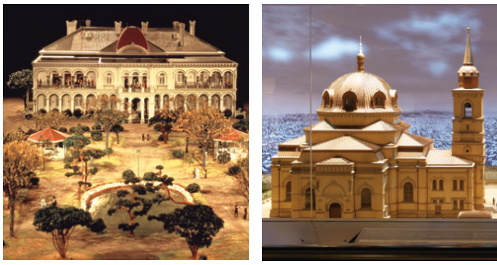
Replica of the Rokumeikan as it was in November, 1885

• Pre-school and elementary school children •Junior high school students who are residents of Tokyo