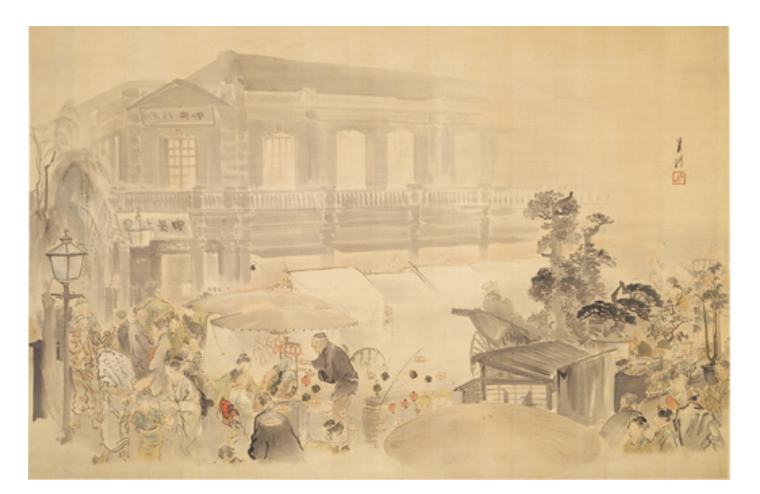
The Bustle of People in Front of the Chuo Shimbunsha Building on Ginza Brick Street Ogata Gekko, late Mei

Half a century ago, when historians of my generation were beginning to study the history of architecture, we believed that the history of modern architecture in Japan could be understood without reference to those chaotic styes originating from European. As our research progressed, however, we came to understand that it was a mistake to ignore historic styles. We needed to know why, out of so many possibilities, did an architect choose the one on which he based his design? The