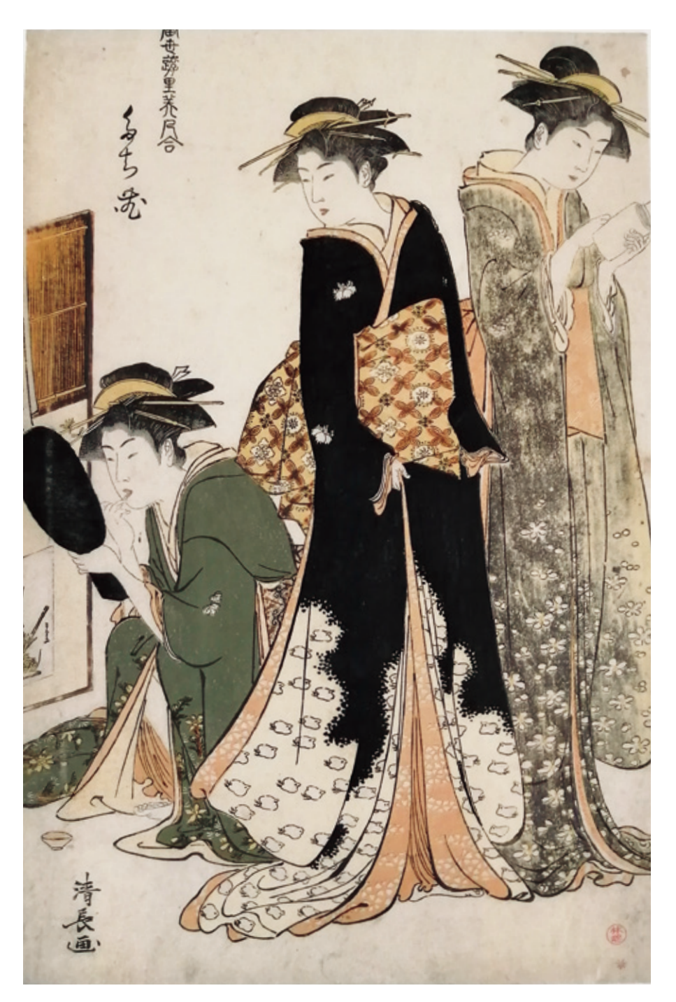
Tachibana, from the Contemporary Beauties of the Pleasure Quarters series Torii Kiyonaga, ca. 1782–84

Among commoners living in Edo aesthetic consciousness of iki became established in the late eighteenth century, during the Tenmei and Kansei