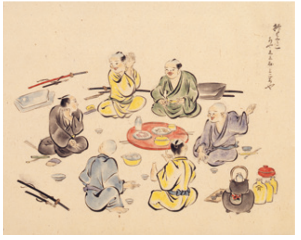
A nostalgic view of life in the Edo barracks painted at the request of the old retainers.

Even during the Great Peace of the Edo period, samurai did not neglect their training in the use of guns. Here we explore the firearms and other weapons, apart from swords, used by samurai in (Curator: Tahara Noboru) their role as warriors.