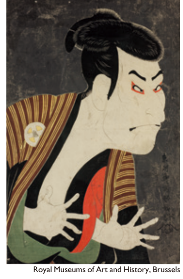
The Actor Ōtani Oniji Ⅲas Edobei

*Displays will be changed during the exhibition.