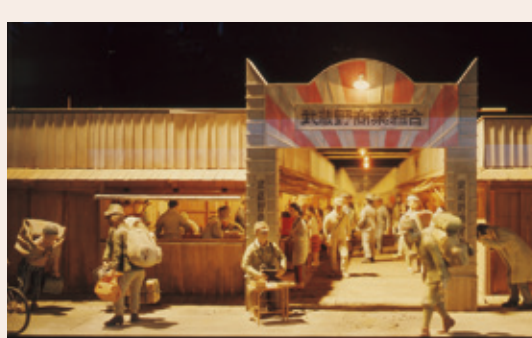
2: Shinjyuku (Night view of black market) / model Restoration time period: 1947, fall Scale: 1/10

Restoration time period: 1948, fall Scale: 1/120